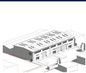
Yeovil Planning Win

Another Planning win, this time in Yeovil. Somerset Council has granted permission for the redevelopment of the former Milk & More site in Yeovil. This project will create circa 14,000 sqft of premium industrial warehouse space, spread across three units on the Lynx Trading Estate. We look forward to commencing construction early this year.