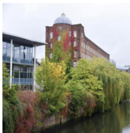
St. James Mill