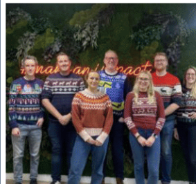
Christmas Jumper Day

We were delighted to see St. James' Mill planning application submitted in Norwich, transforming the iconic building into an 88-bedroom luxury hotel, complete with stunning views across the city, as well as a restaurant and bar.